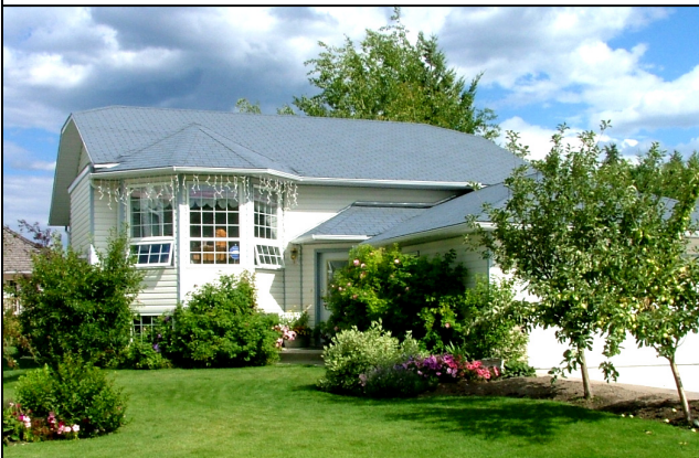
Cranbrook homestay home.