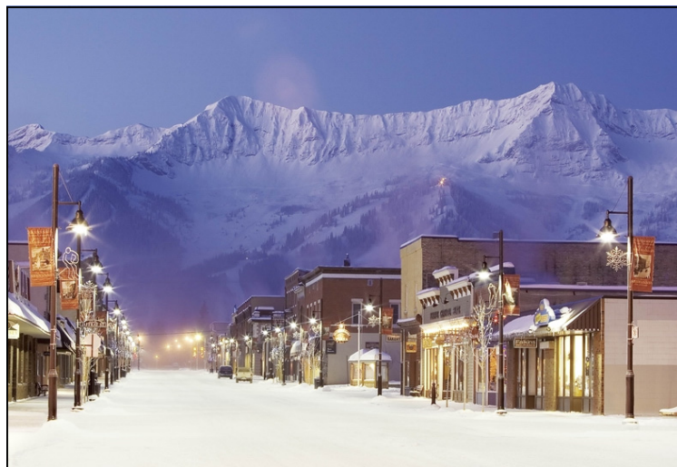
Downtown Fernie with the Fernie Alpine Resort in the background.