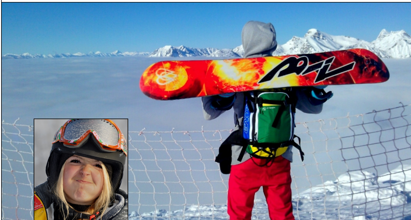
German student at Polar Peak, Fernie Alpine Resort

Ski and snowboard are very popular sports with our international students! There are two excellent ski resorts in our area. The most famous is the Fernie Alpine Resort, www.skifernie.com , which is located only 5 minutes from Fernie, and is rated as the second best ski resort in Canada. However, the Kimberley Alpine Resort, www.skikimberley.com , located about 25 minutes from Cranbrook, is also outstanding! We offer special ski buses on most weekend and holiday days during the ski season to make it very easy for our Cranbrook students to get to the Kimberley ski hill.