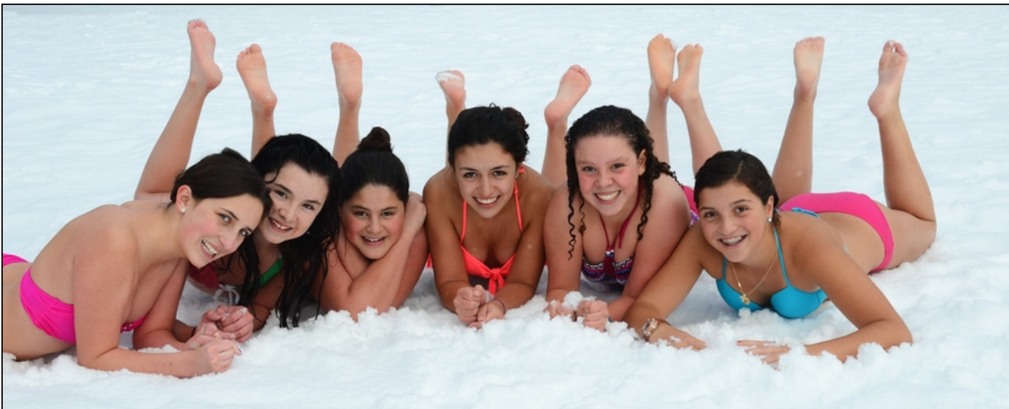
Mexican students in the snow at Fairmont Hot Springs.