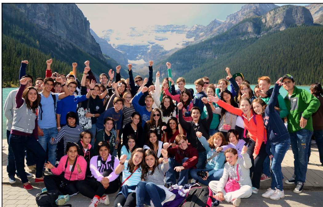
Lake Louise, Banff National Park