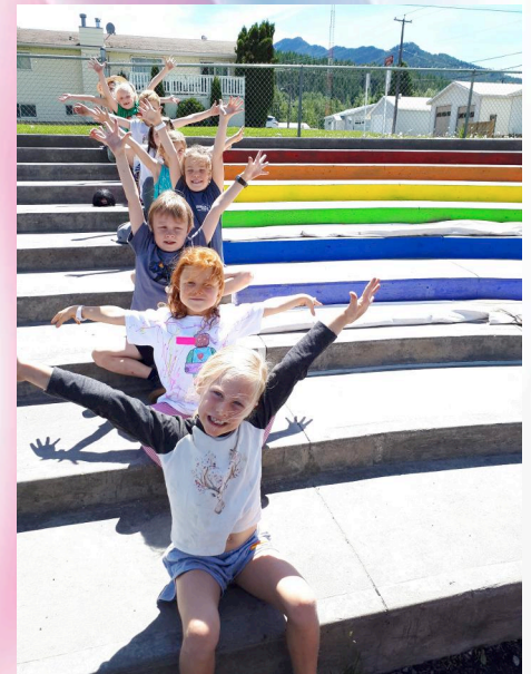
Rainbow amphitheater at Isabella Dicken Elementary School in Fernie!