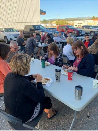
Welcome back breakfast at the Cranbrook Board Office on September 3!