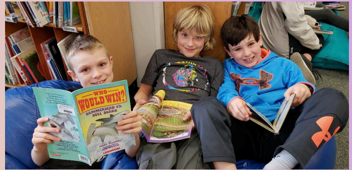
Library Club at Amy Woodland