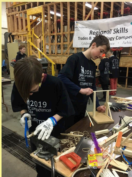
Regional Skills Competition March 1, 2019