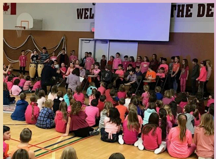
Pink Shirt Day Assembly at GTES