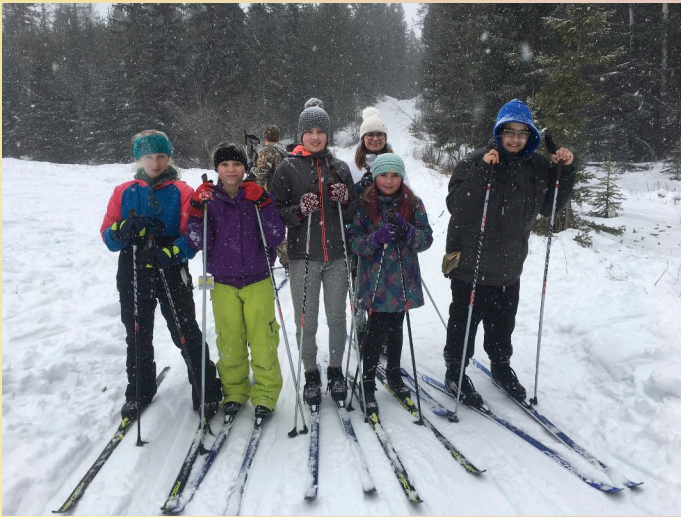
Take me Outside Day at JEJSS