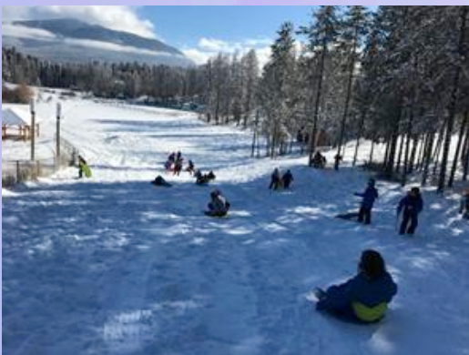
Steeple Elementary sledding on Wilderness Wednesday