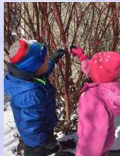
Exploring TM Roberts Elementary garden