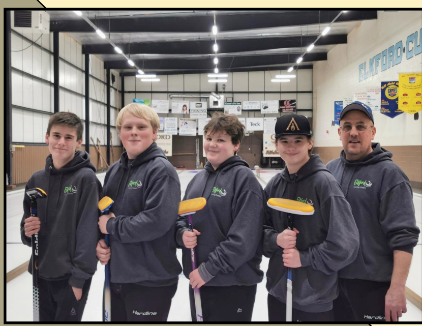
Congratulations to the Elkford Secondary School Boys Curling Team who will be representing the Kootenays at Provincials in Winfield, BC Mar 4-7.