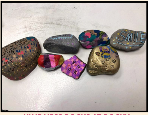
KINDNESS ROCKS AT ROCKY MOUNTAIN ELEMENTARY SCHOOL Be kind