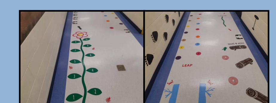
New sensory path at Steeples Elementary School