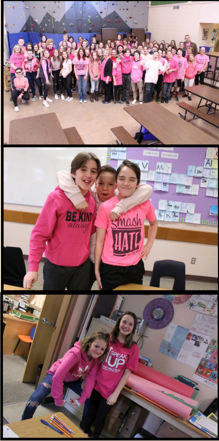
PARKLAND MIDDLE SCHOOL