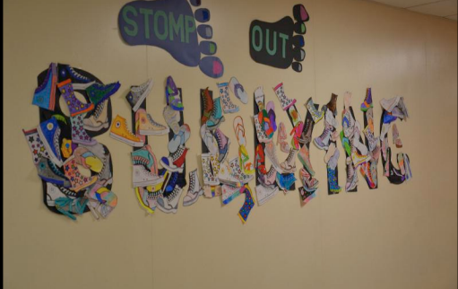
ELKFORD SECONDARY SCHOOL