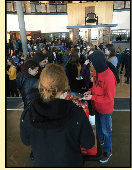
FSS Grad Class serves breakfast to student body!