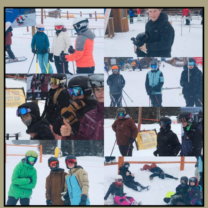
FSS PE 9 and 10 Ski Day, Fernie Alpine Resort