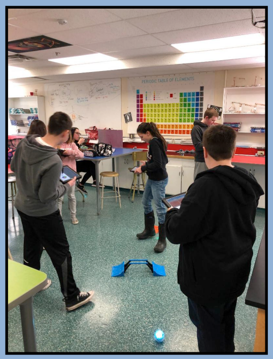
Sheros and coding at lunch time at LMS

Two classes from Steeples walked over to Joseph Creek Village and delivered Valentines to the residents. They also got to sit and enjoy a bowl of ice cream with themJ. The school received a call after by one of the residents of Joseph Creek and they were so thankful and thrilled that the kids visited. It meant so much to them!