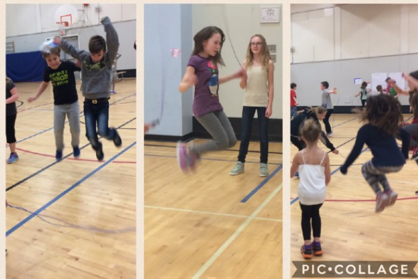
The students at TM Roberts Elementary participated in the 35th anniversary of Jump Rope for Heart last month.