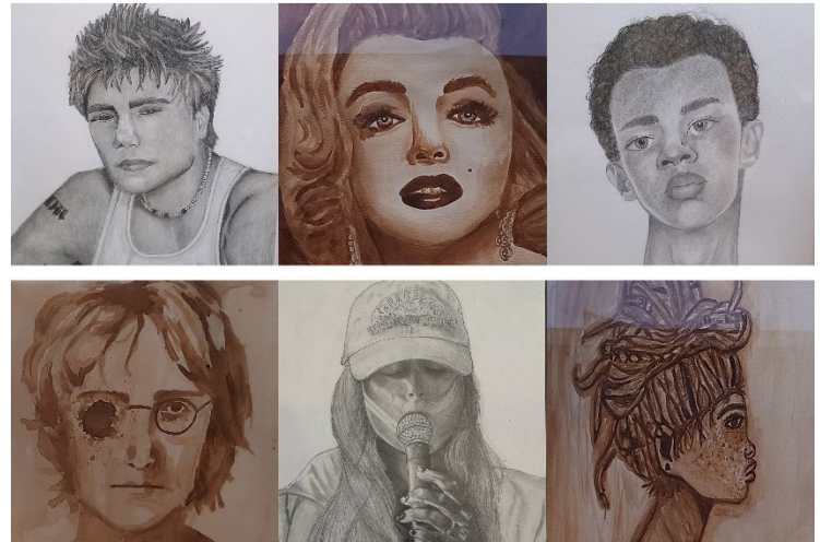
FSS Senior Art Class - Portraits

The FSS Senior Art Class proudly presents a diverse showcase of their recent work. Students are exhibiting their finely rendered pencil portrait drawings alongside a unique series of coffee-painted portraits, created using traditional watercolour techniques applied in a new and innovative way.