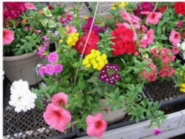
Full Sun (may vary)