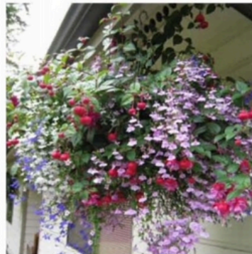
Shade/Part Shade (may vary)