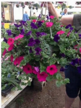
Single Rainbow Wave