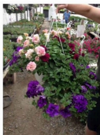
Double Rainbow Wave